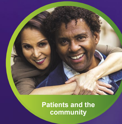
Patients and the community

The goal of this initiative is to optimise the standard of care for hearing impaired adults by addressing the unmet needs of patients, primary care providers, hearing health professionals (HHPs) and policymakers.